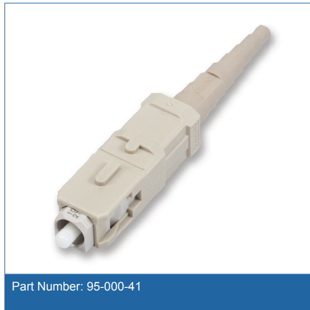
Part Number: 95-000-41