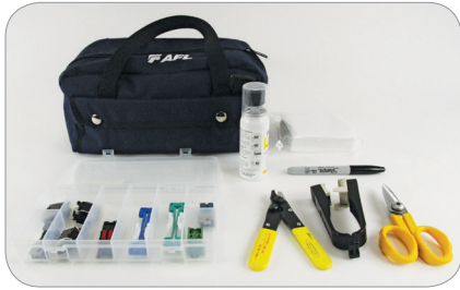
FUSEConnect Tool Kit Contents