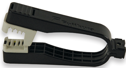
Cord Splitter Tool