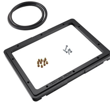
1200PF Special Application Panel Frame