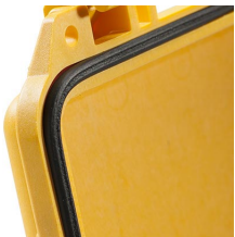
1203 Replacement O-ring