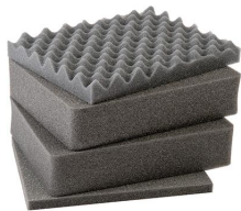
1301 4 pc. Replacement Foam Set