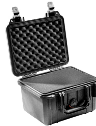
1300WF With Foam