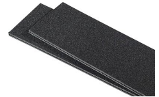
1300TPDIV Extra TrekPak Dividers