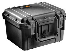
1300NF No Foam