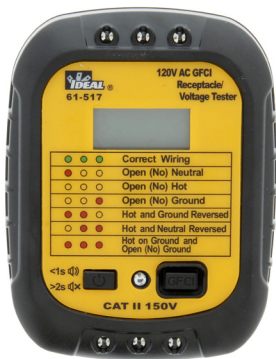
61-517 120V AC GFCI Receptacle/Voltage Tester CAT II 150V AC