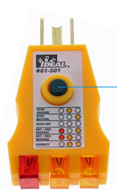
61-501 GFCI Receptacle Tester