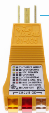
61-035 E-Z Check® Circuit Tester