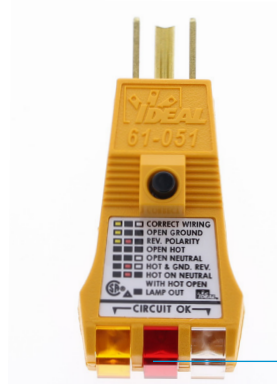
61-051 E-Z Check® Plus GFCI Circuit Tester