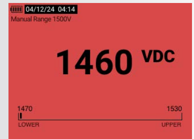
Limit gauge - outside of range