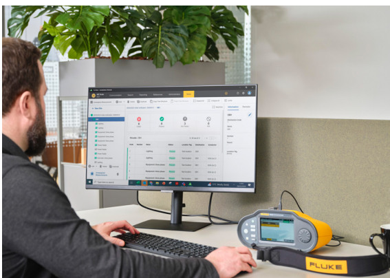
TruTest Software simplifies electrical system data management and reporting

The Fluke 1674 FC includes a patented Insulation PreTest, so you can better protect the installation and avoid costly mistakes. If the tester detects that appliances are connected to the system during the test, it will stop the insulation test and provide a visual and audible warning. This helps eliminate accidental damage to peripheral equipment and saves you both time and money.