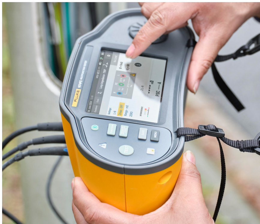
Full-color touch screen and tactile rotary knob for fast navigation

Simplify report generation with automatic report population, Fluke Connect integration, and one-touch reporting with Fluke TruTest™ software.