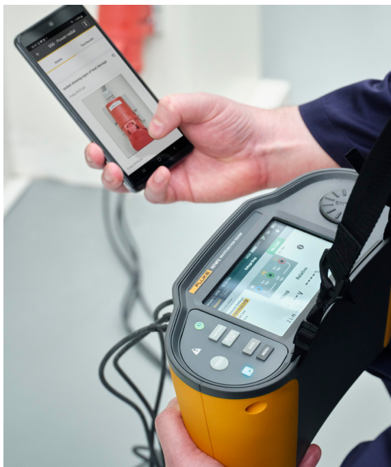
Assign photos directly to specific test points for more detailed documentation