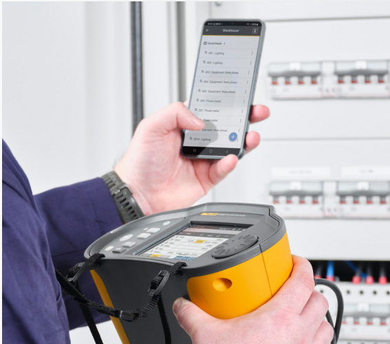
Reduce manual data entry and recordkeeping