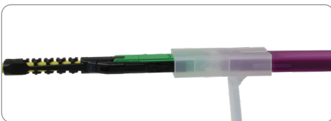
Cleaning MMC-16 connector on jumper

Must-have tool for field use A favorite of field technicians for its ease of use, durability, effectiveness, and small size