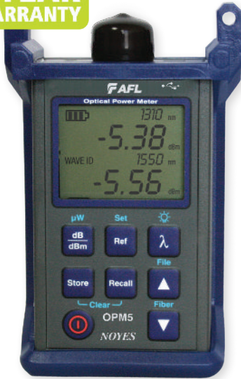
OPM5 Optical Power Meter